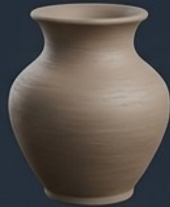
The Name & Form ( nāma-rūpa )